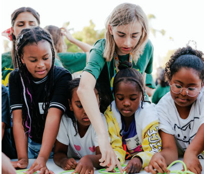
LEFT: Children at La Sierra University church work on a craft. RIGHT: Leaders at the San Ysidro church lead in a prayer reading.

What makes VBS so powerful isn't just the decorations or songs (though those are fun!). It's the way the Spirit moves through the