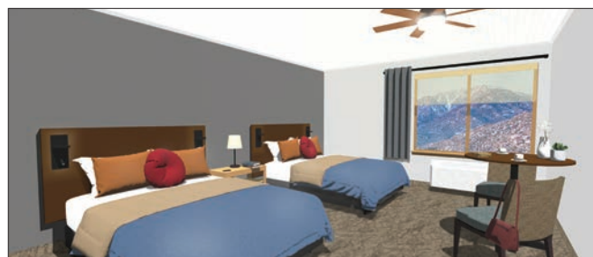
This mockup gives an idea of what one of the PSR rooms may look like.